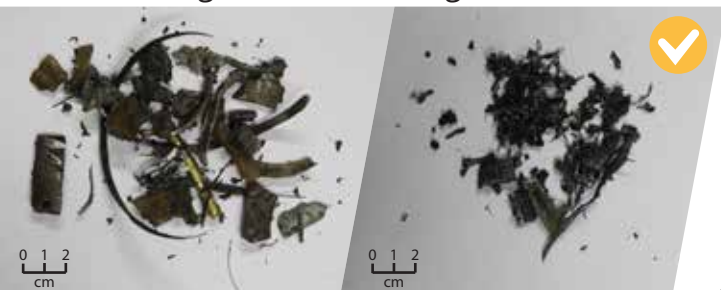
Cutting recovered during the test